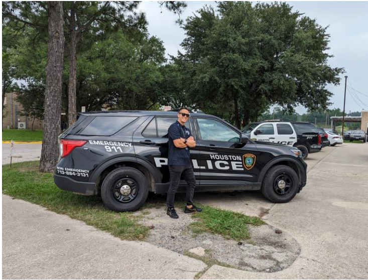
Police Academy – Indoor Training Facility